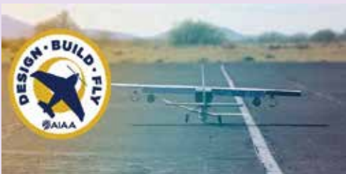
30th Annual Design/Build/Fly Competition | 16–19 April 2026 | Wichita, KS (USA)